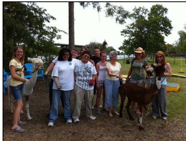
Transition Students visit Alpaca Ranch.

It is amazing to tour the VIP Center and observe how their talented, educated, nationally certified staff, teach each person how to develop new skills so that each person can live independently, work, and experience a full life. Many of the clients will share they regained 'hope' for living once they learned how to live with this most feared disability. Daily, people learn how to do the most basic living skills of cooking, cleaning, matching of clothing, laundry, dealing with minor household emergencies, navigating their home, and all aspects of self-care. Quickly, each individual learns how to navigate in their community, places of shopping, worship, and places of business and employment. There's more. If an individual chooses, there is a wide variety of technology that is available to be used. The highly trained staff teach the use of simple & complex magnification devices, cell phones, computers, internet utilization, smart and iphones, along with iPads, GPS devices, along with softwares that magnify and speak to the user.